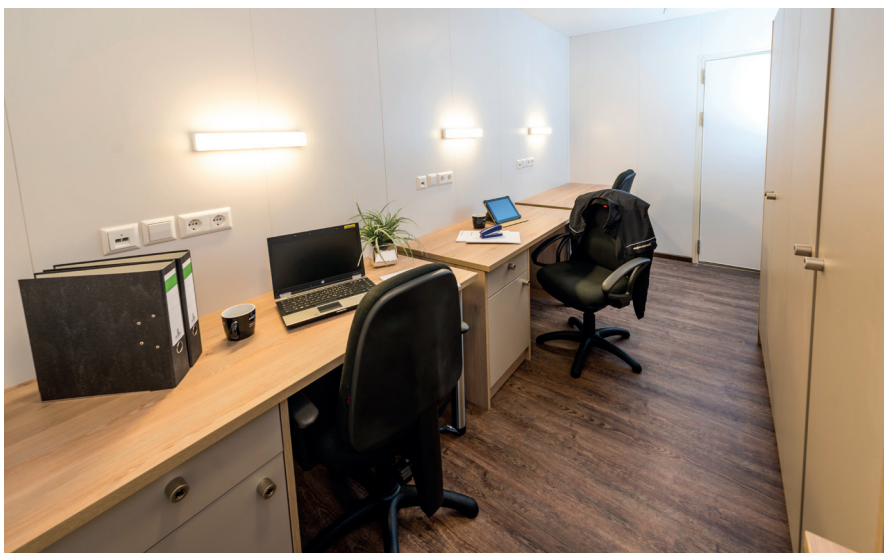
Equipped as an office

HG: For rented containers, the layout is fixed. It is standardised and extremely functional. The advantage of this is that we can assemble all types of units easily, free of