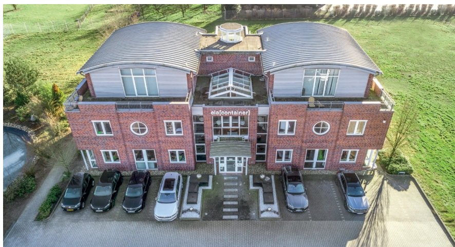
Office building ELA Container Offshore GmbH in Haren, Germany

PES: Your mobile rooms are available in various configurations. How do you