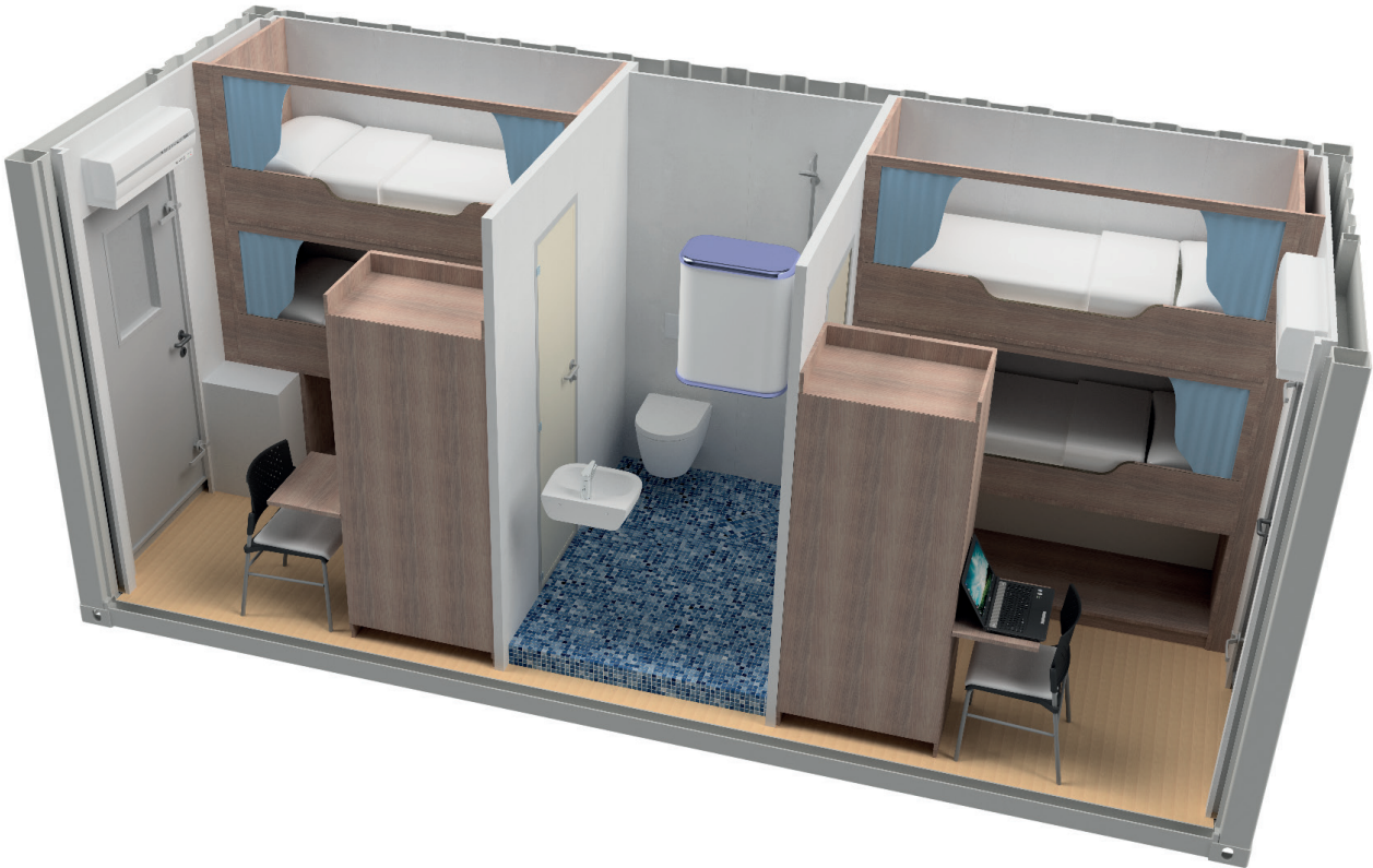
20ft ELA Offshore ALLROUNDER Living Quarter with shared sanitary unit