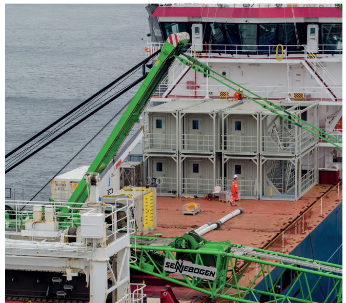
Container unit on a vessel