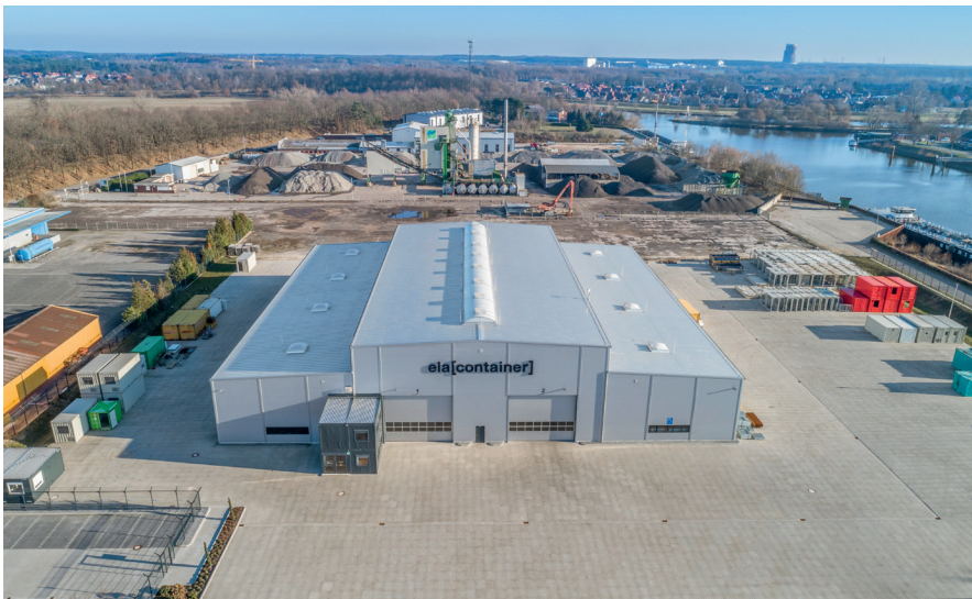
Production hall in Haren, Germany

problems, and as quickly as possible. Above all, we strive to satisfy all our client requests as much as possible.